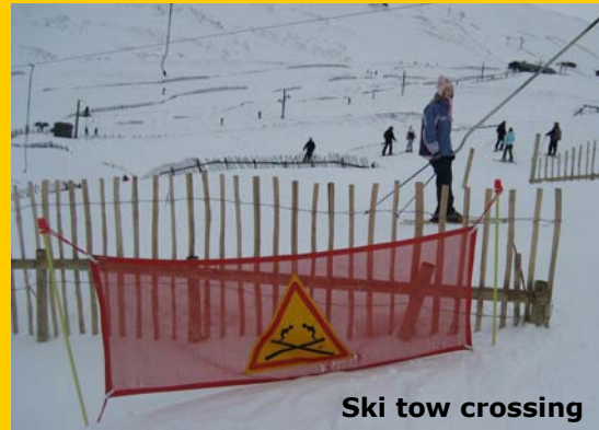
Ski tow crossing

Glenshee Ski Patrol are supported and trained by the British Assoc. of Ski Patrollers